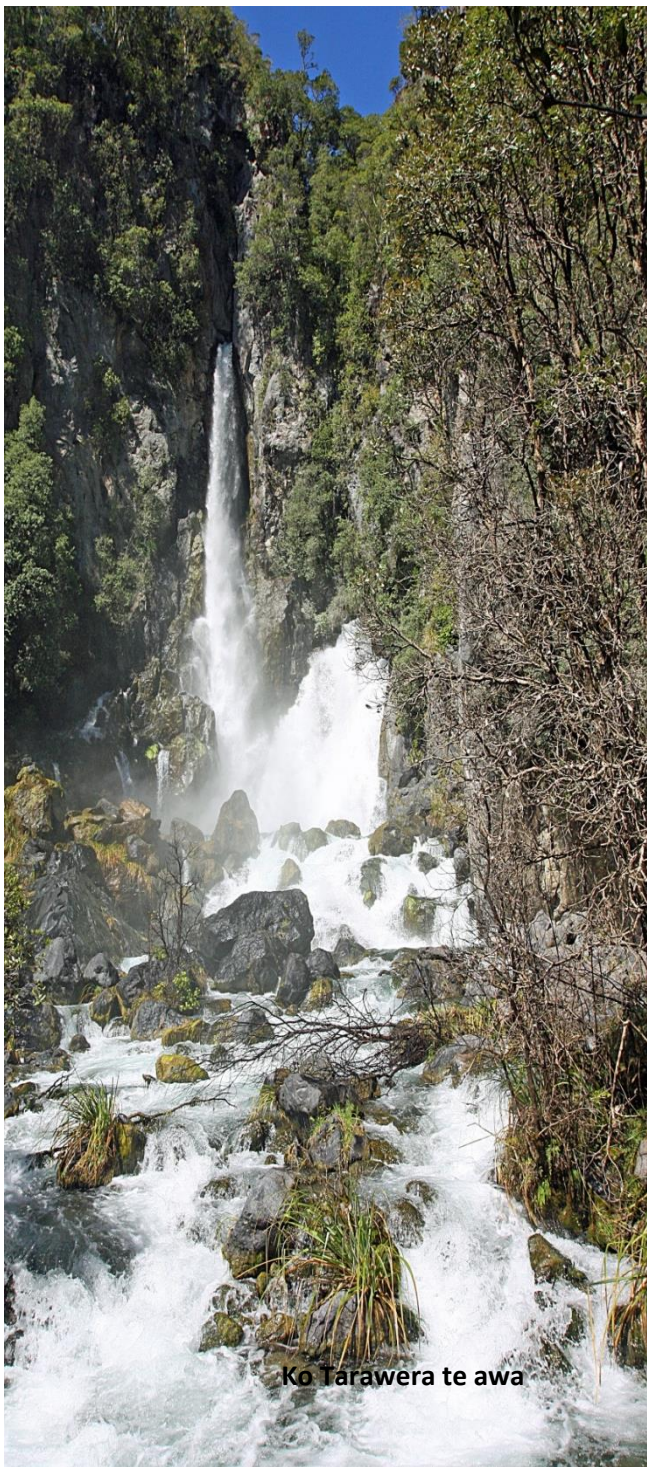
Ko Tarawera te awa